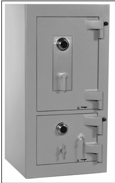
MODEL #4824-DS TL-30

Worldwide Safe and Vault's new TL-30 Double Door Depository Safe offers complete cash management versatility for any operation that requires a non-returnable deposit such as movie theaters, convenience stores, restaurants, armored car companies, etc. The UL-TL-30 Composite Construction offers peace of mind when overnight protection is required.