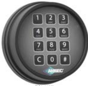
ESL20XL Matte Black