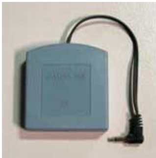
Power Override Box